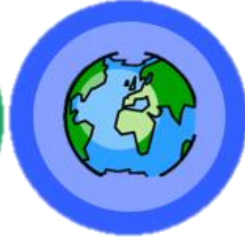
Place & Space

To experience the diverse natural environment that we co-exist in and how our behaviours over time change the natural beauty around us.