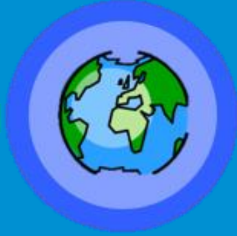
Place & Space